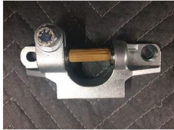
Coupler Part Number 59246663